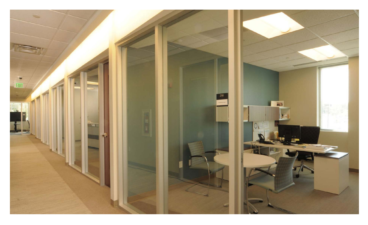
Many clients require both transparency and acoustical privacy. Arium utilized a mix of hard walls and aluminum frame systems to achieve both for this client.

Indeed, this mix of open and closed space seems to be preferred by many of today's most innovative companies. When Arium started working with the tech firm Social Growth Technologies, we conducted initial discussions to gather information about their space needs, and then presented them with multiple design ideas. Although collaboration was a key requirement, Social Growth had real concerns about acoustical distractions. In fact, like many of our clients, it was determined that each of their working groups had very unique combinations of collaboration and privacy needs.