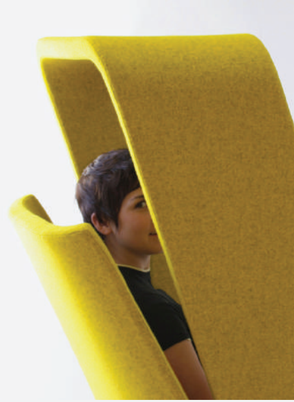
WINDOWSEAT LOUNGE BY MIKE & MAAIKE