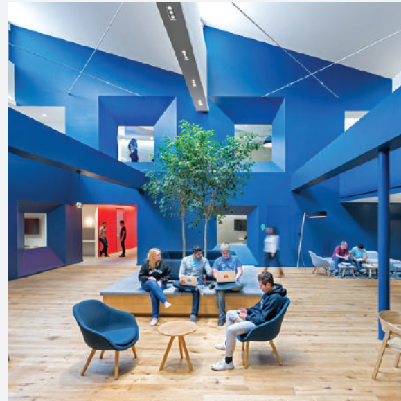
PRIMARY COLORS: BEATS BY DRE HEADQUARTERS