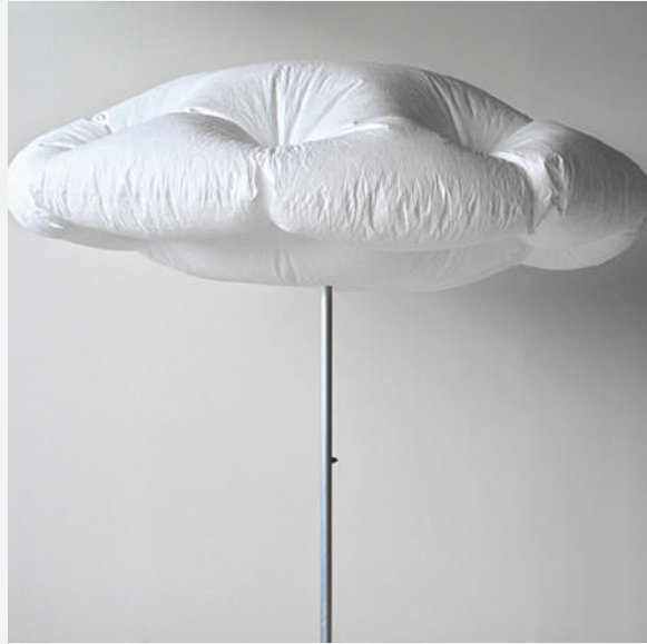
THE CUMULUS PARASOL BY STUDIO TOER