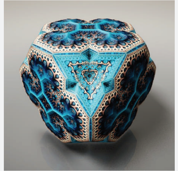
FABERGE FRACTALS BY TOM BEDDARD