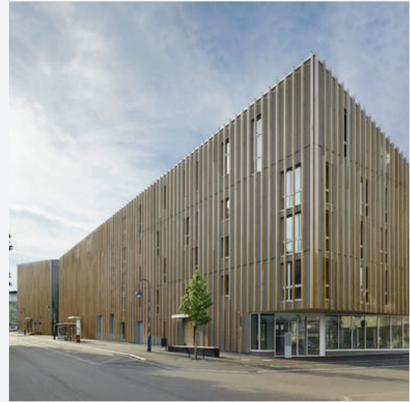
STADTHAUS M1 BY BARKOW LEIBINGER