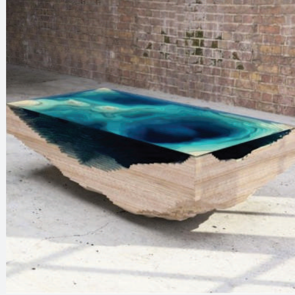
THE ABYSS TABLE