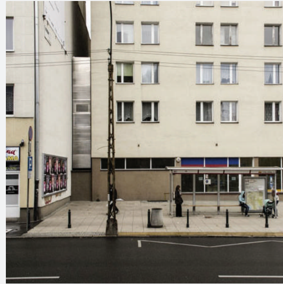
COLLECTION: SUPER SKINNY HOUSES