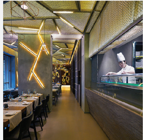
TAIYO SUSHI RESTAURANT IN MILAN