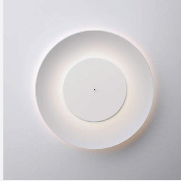
AWARD WINNING LIGHT: TOTAL ECLIPSE