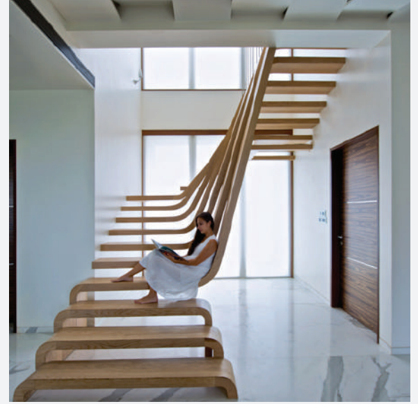
WAVES OF WOOD STAIR