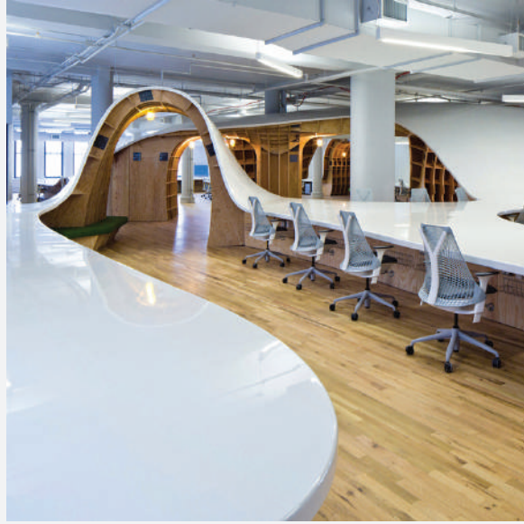
CLIVE WILKINSON'S ENDLESS DESK