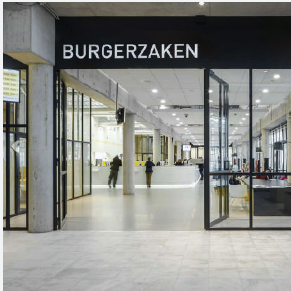
ALMERE CITY HALL