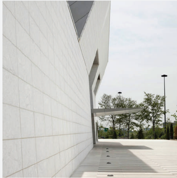
FUMIHIKO MAKI'S AGA KHAN MUSEUM, TORONTO