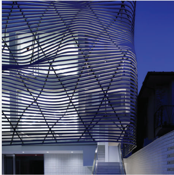
DEAR JINGUMAE BUILDING