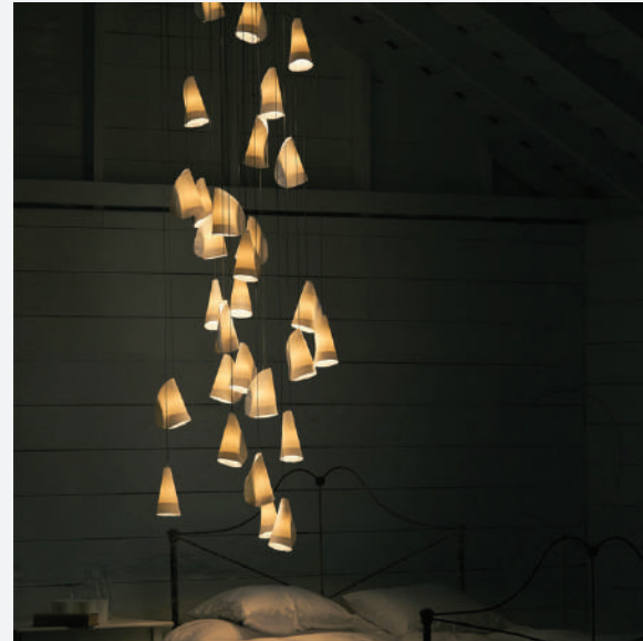
21 SERIES LIGHTING FOR BOCCI