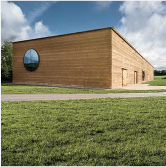
RICOLA PLANT BY HERZOG & DE MEURON