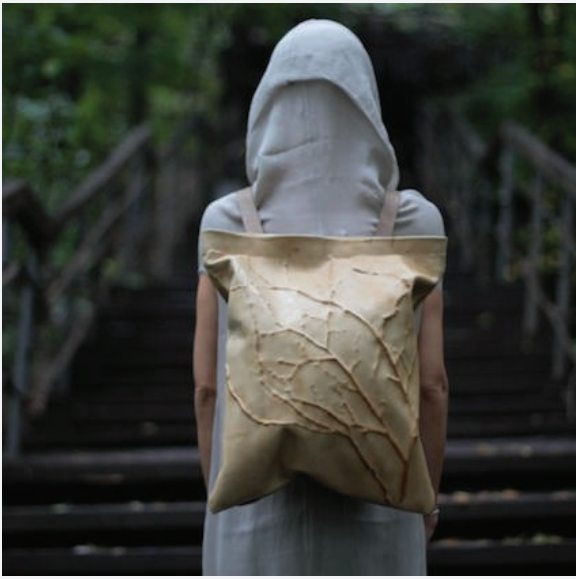
ANATOMIC FASHION BY KOFTA