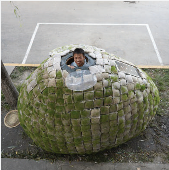
EGG-HOUSE BY DAI HAIFEI