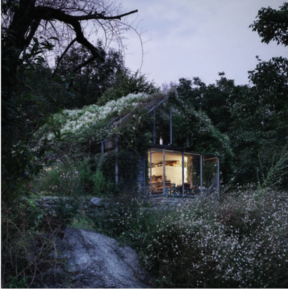
GREEN BOX BY ACT ROMEGIALLI ARCHITECTS