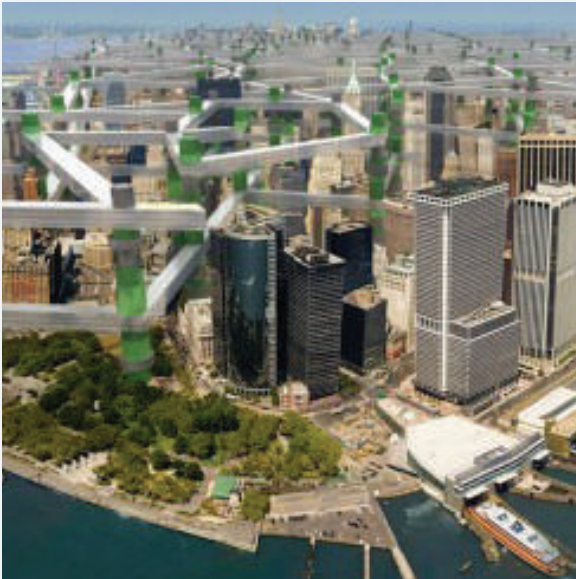
EFFICIENT LIVING MACHINE