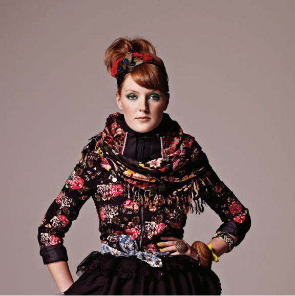
THE INVISIBLE BICYCLE HELMET BY HOVDING