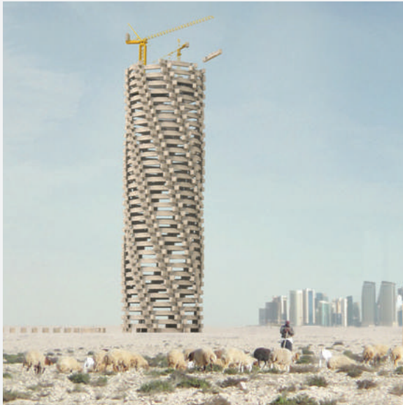
QATAR WORLD CUP MEMORIAL