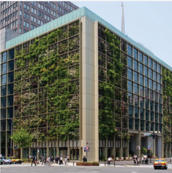
OFFICES OF PASONA, JAPAN