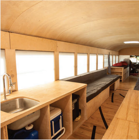
HANK BOUGHT A BUS