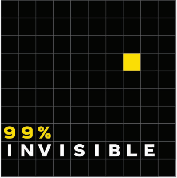
99% INVISIBLE: EDGE OF YOUR SEAT