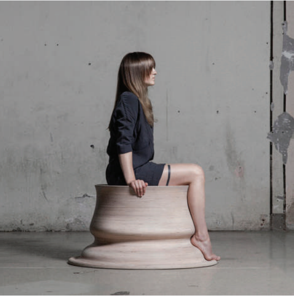
EMBRACING TOUCH BY MARIJA PUIPAITEV