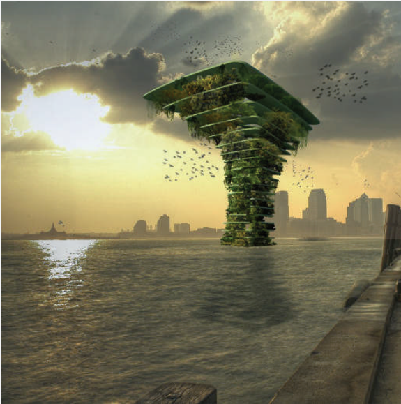
CITY APP BY WATERSTUDIO