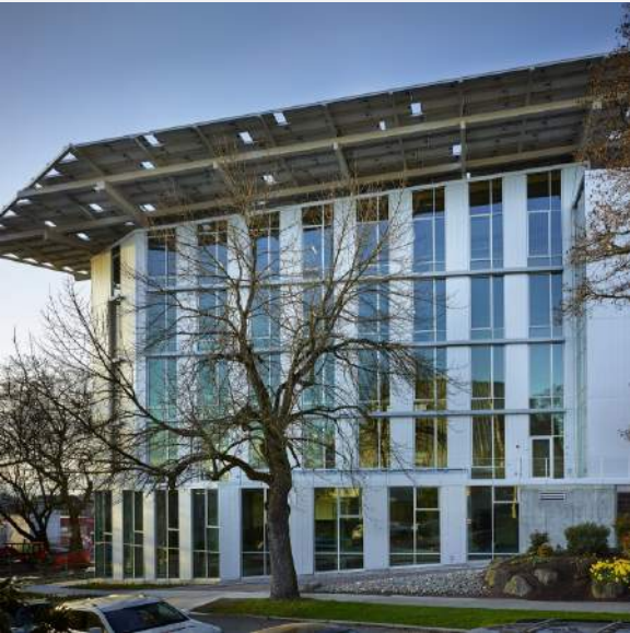
BULLITT CENTER BUILDING, SEATTLE