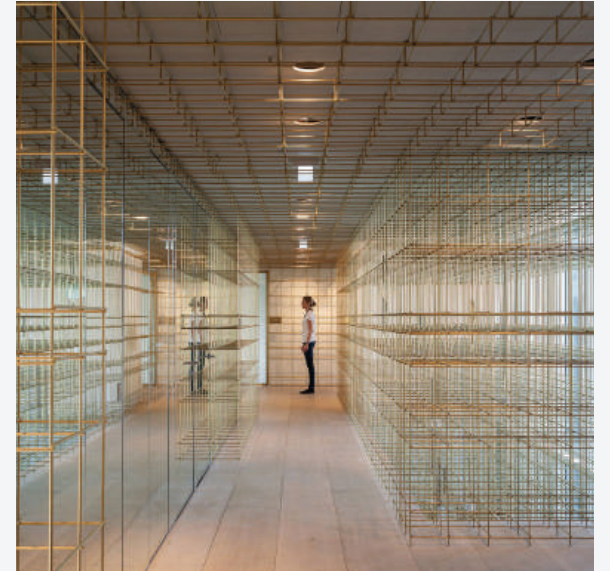
AMORE SULWHASOO FLAGSHIP STORE