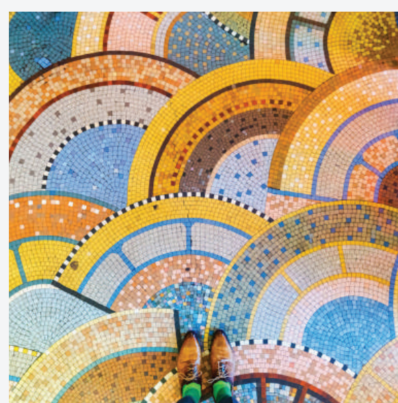
PARIS MOSAIC FLOORS