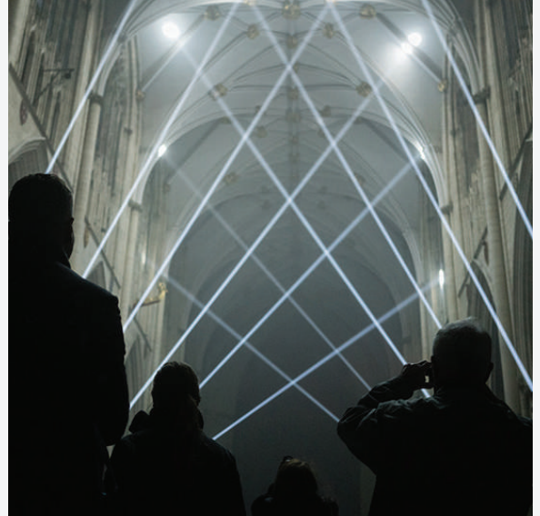
LIGHT MASONRY INSTALLATION