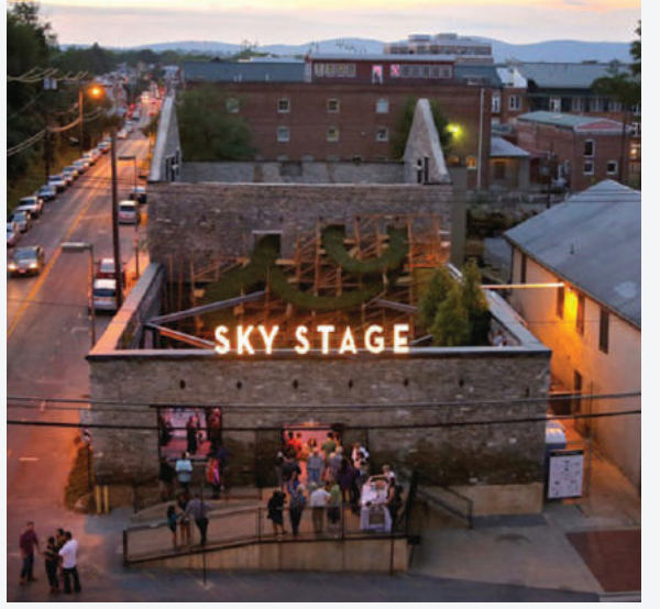
SKY STAGE - FREDERICK MARYLAND