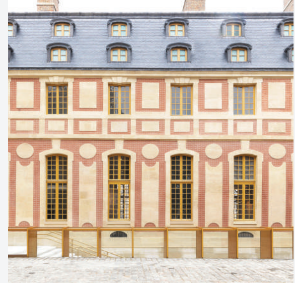
PAVILION DUFOUR CHATEAU DE VERSAILLES