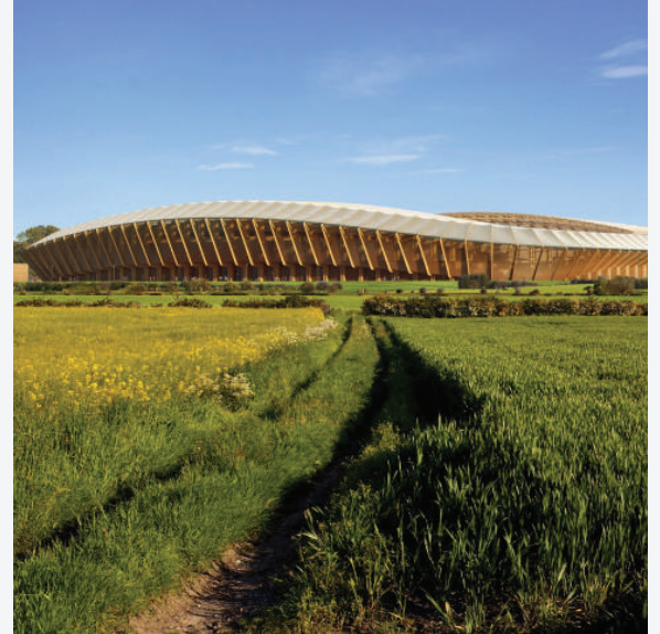
FOREST GREEN ROVERS STADIUM